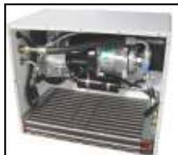
Removable Cover For Easy Service