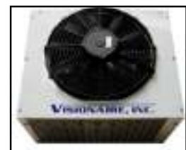
Mount Vertically OR Horizontally